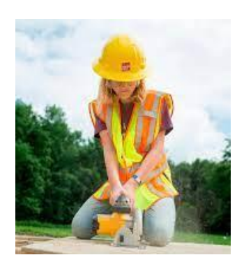
Tools - Hand and Power