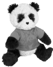
Miranda Panda & Me Set OR $30 Cookie Dough 300+ Packages