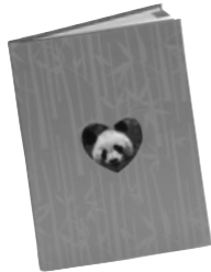
Panda Journal OR $15 Cookie Dough 150+ Packages