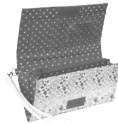
Wristlet Wallet OR $40 Cookie Dough 400+ Packages