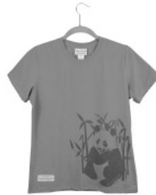
Panda Classic Tee OR $20 Cookie Dough 200+ Packages