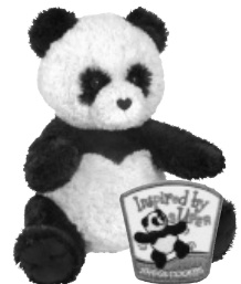
Mama Miranda Panda & Super Patch OR $50 Cookie Dough 500+ Packages