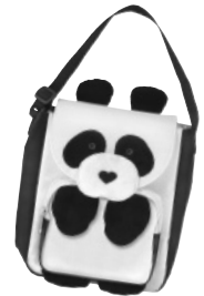
Panda Lunch Bag OR $25 Cookie Dough 250+ Packages