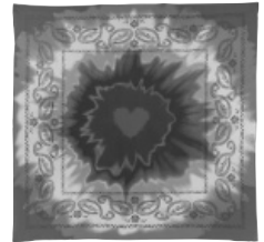
Tie Dye Bandana OR $10 Cookie Dough 100+ Packages