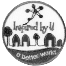
Theme Patch 25+ Packages