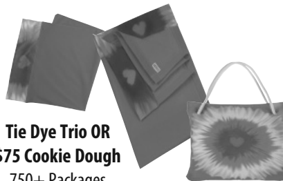
Tie Dye Trio OR $75 Cookie Dough 750+ Packages