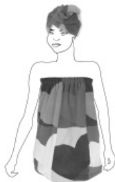
Girl Towel Wrap Set OR $60 Cookie Dough 600+ Packages