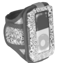
iPod Armband & Choice of iPod Nano OR iPod Gift Card OR $100 Cookie Dough 1,000+ Packages